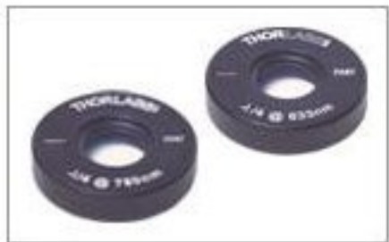
Multi-Order Wave Plates