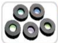
Precision Achromatic Retarders