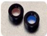
Quartz Waveplates (Retarders)