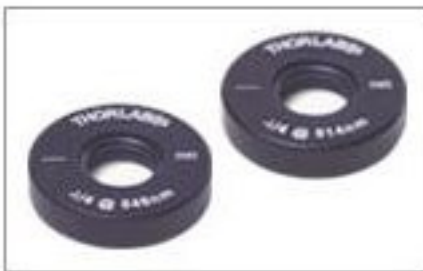
Zero-Order Wave Plates