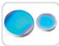
1310nm & 1550nm True Zero-Order Waveplates