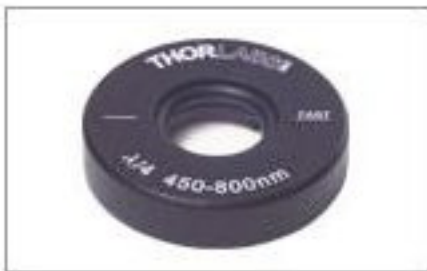
Achromatic Wave Plates